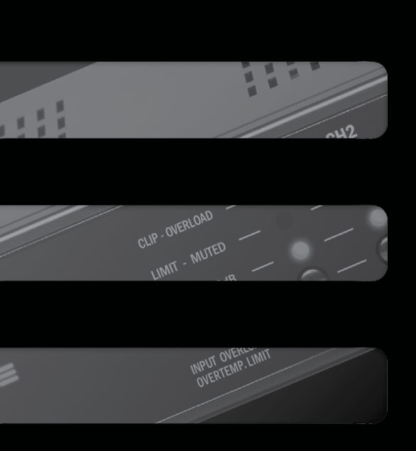
REVAMP2250 Instruction manual